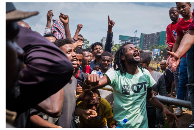
Demonstrators protest the deaths of 23 people in ethnic violence in Addis Ababa, Ethiopia, in September 2018.

Ethnic violence in Ethiopia has forced nearly 3 million people from their homes